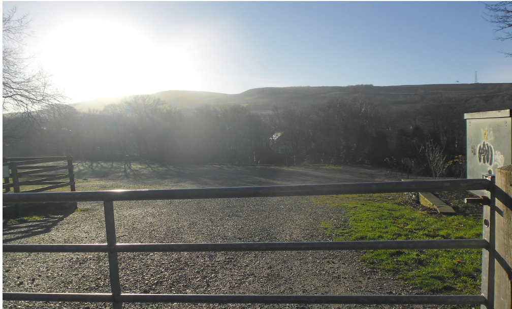
Photo of site 3 taken from Swallow Lane