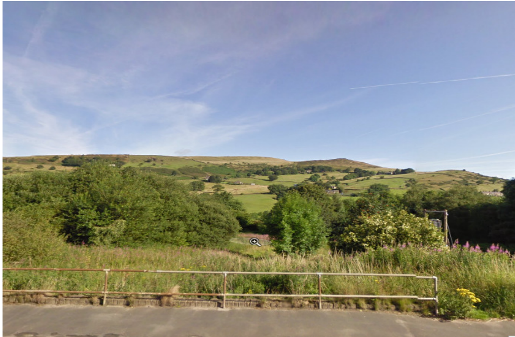
Photo of site 4 Taken from New Mills Road.