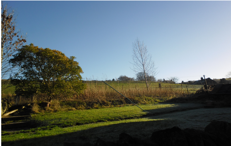
Photo of site 1 taken from rear of 'The Mount'