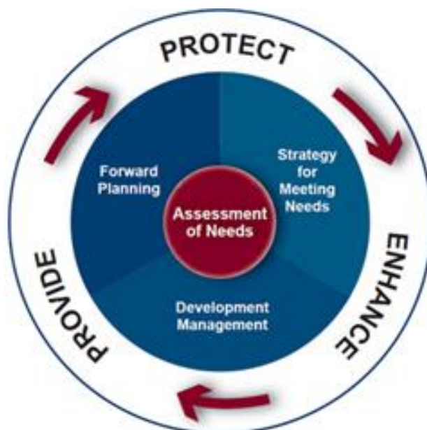
Figure 1: Sport England themes

To provide new outdoor sports facilities where there is current or future demand to do so.